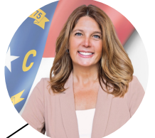
Michele Morrow NC Super of Public Instruction