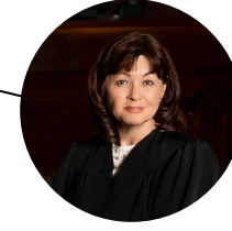
Valerie Zachary NC Court of Appeals Judge Seat 14