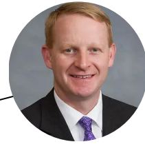
Tom Murray NC Court of Appeals Judge Seat 12