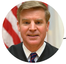
Warren McSweeney NC Superior Court Judge District 29 Seat 2