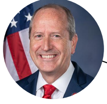
Dan Bishop NC Attny General