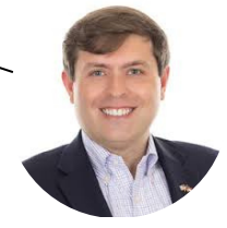
Luke Farley NC Comm of Labor