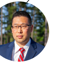
Yohan Namkung NC Superior Court Judge District 29 Seat 5