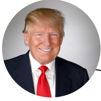
Donald J. Trump President