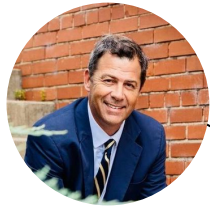
Hal Weatherman NC Lt. Governor