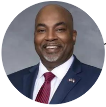
Mark Robinson NC Governor