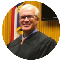
Skipper Creed NC Superior Court Judge District 29 Seat 3