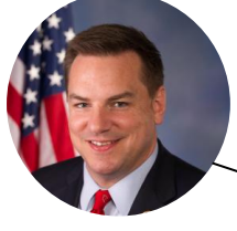
Richard Hudson US House of Reps Dist 9