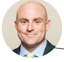
Danny Earl Britt, Jr NC Senate District 48